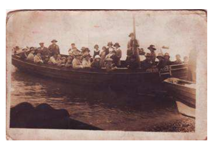
An Elham school outing to the Isle of Sheppey, leaving Elham by train to Canterbury, then Whitstable where they caught this vessel "Moss Rose" which took them over to the Island.