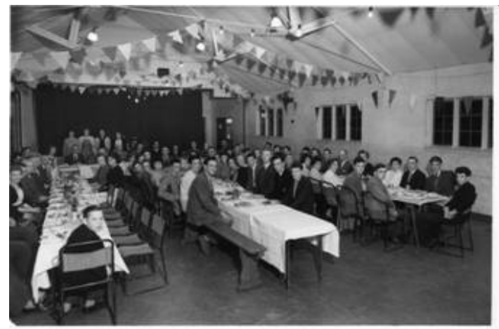
The old Elham Village Hall, scene of many entertaining events.