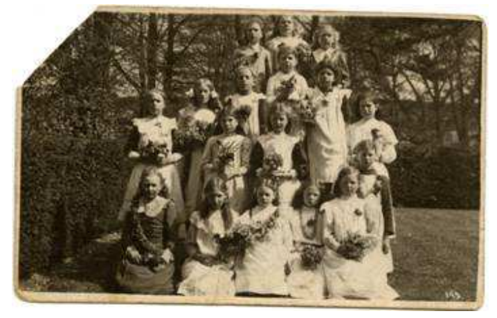
1<sup>st</sup> May 1914 Elham Vicarage Garden