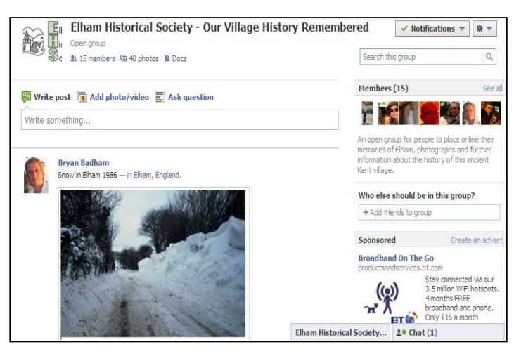
Our Facebook Home Page

Following on from the success of a couple of other local towns we now have our own Facebook group where people (EHS members and non members) can upload pictures and make comments about Elham's history. If you are on Facebook then please take a look at <a href="https://www.facebook.com/#!/groups/317708811602063/">https://www.facebook.com/#!/groups/317708811602063/</a>. The Ashford history group has over 2,000 members worldwide, with over 3,300 historical photos, to date we have 15 members and 40 photos, so let's see if we can increase those numbers!